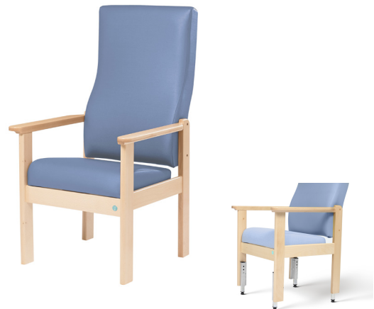
Shown with optional seat height adjusters

Perry is a stylish, durable and comfortable upholstered high back patient chair for day long postural support.