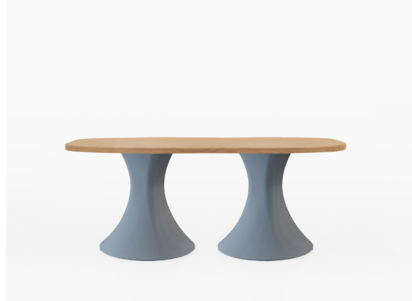
Laminate top option shown

Roku® Oyster is a secure, extremely durable table collection with one-piece rotationally moulded base for challenging environments.