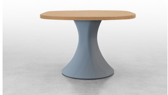
Laminate top option shown

Roku® Oyster is a secure, extremely durable table collection with one-piece rotationally moulded base for challenging environments.