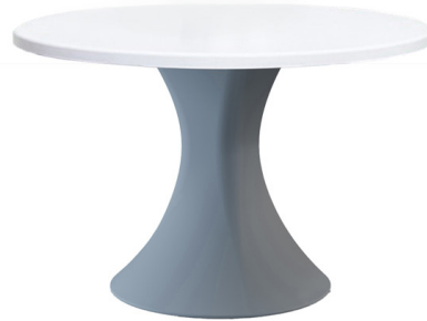
KYDEX® top option shown

Roku® Oyster is a secure, extremely durable table collection with one-piece rotationally moulded base for challenging environments.