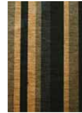
Toba Mandrake 8038