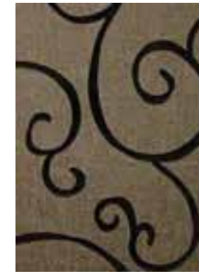
Lugano Jericho 8039