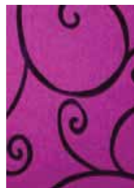
Lugano Candy 8017