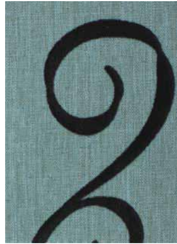
Lugano Frost 8023