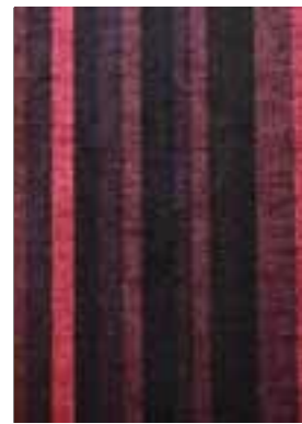
Toba Cabernet 8014