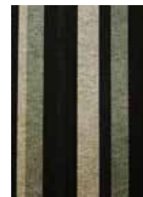
Toba Pontif 8044