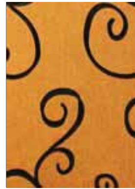
Lugano Pumpkin 8006