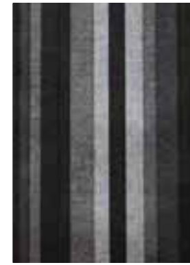
Toba Melville 8021