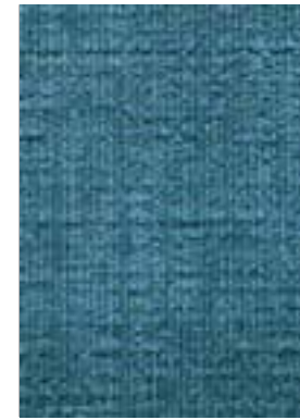
Garda Harbour 8020