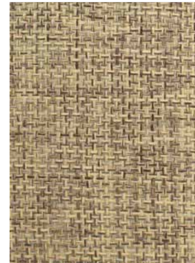
Tahoe Twine 8042