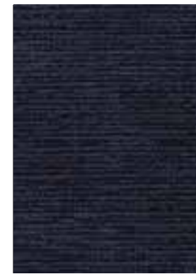
Garda Volute 8024