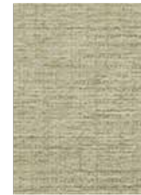
Garda Bali 8040