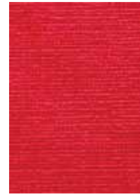
Garda Iznik 8013