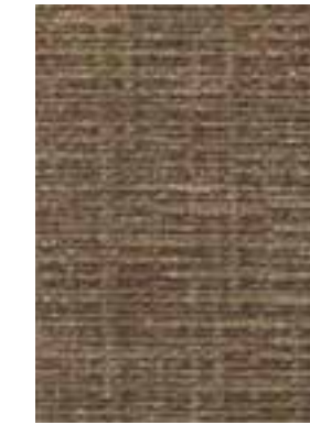
Garda Pigeon 8033