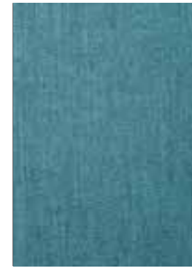
Kariba Reef 8019