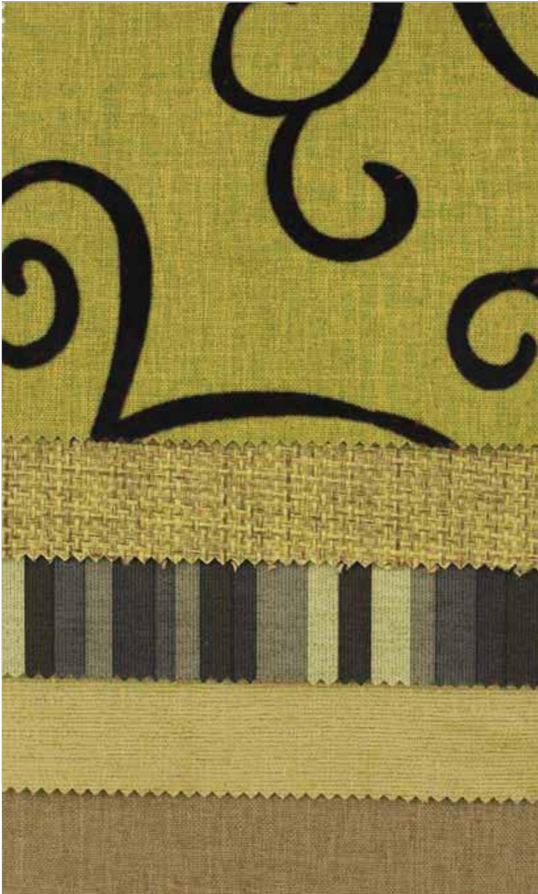
Lugano Acacia 8001