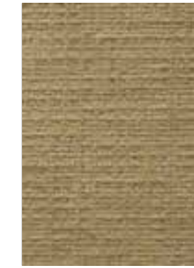
Garda Moth 8036