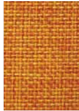
Tahoe Clementine 8007