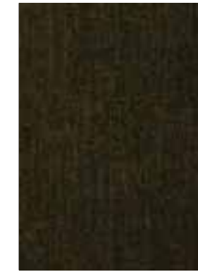
Kariba Pepper 8034