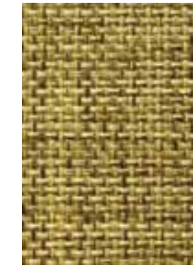
Tahoe Jute 8037