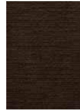
Garda Baskerville 8035