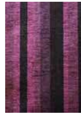
Toba Balsam 8025