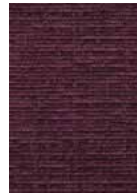
Garda Rapture 8026