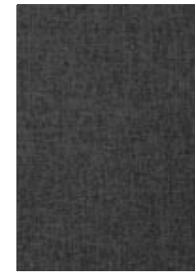
Kariba Shade 8027