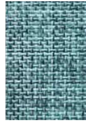
Tahoe Umber 8022