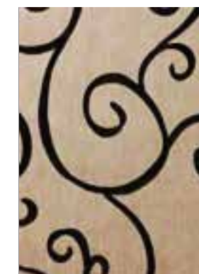
Lugano Canvas 8043