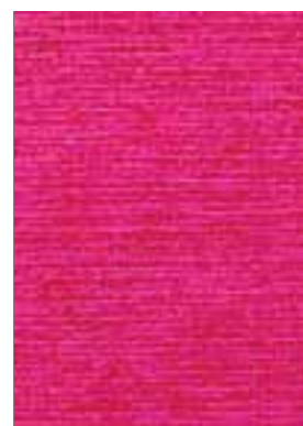
Garda Rhubarb 8016