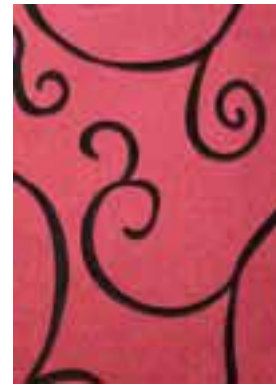
Lugano Burma 8012