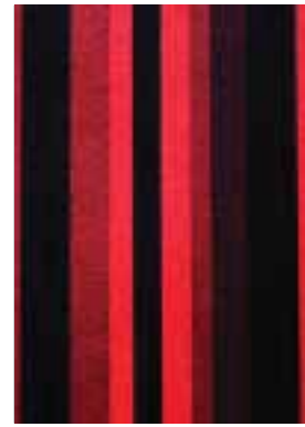
Toba Brimstone 8011