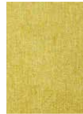
Kariba Macadamia 8041