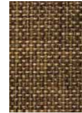
Tahoe Gable 8032