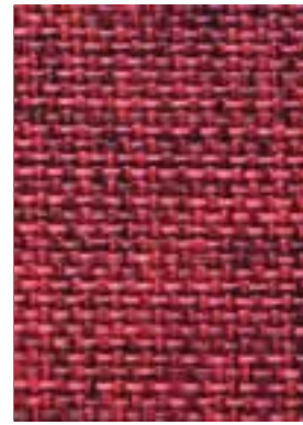
Tahoe Masai 8010