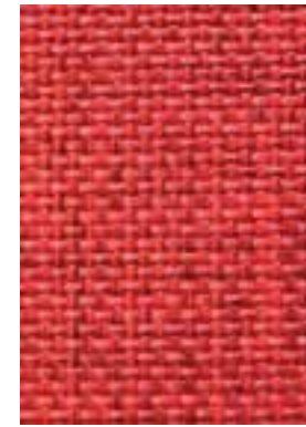
Tahoe Canyon 8009