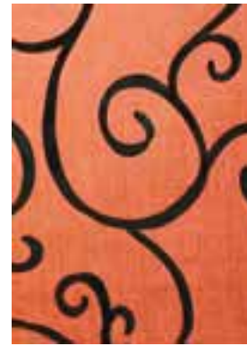
Lugano Flowerpot 8008