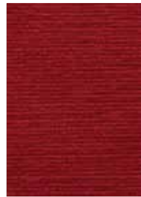
Garda Beetroot 8015