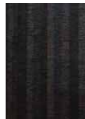
Toba Thunder 8029