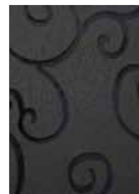
Lugano Baize 8028