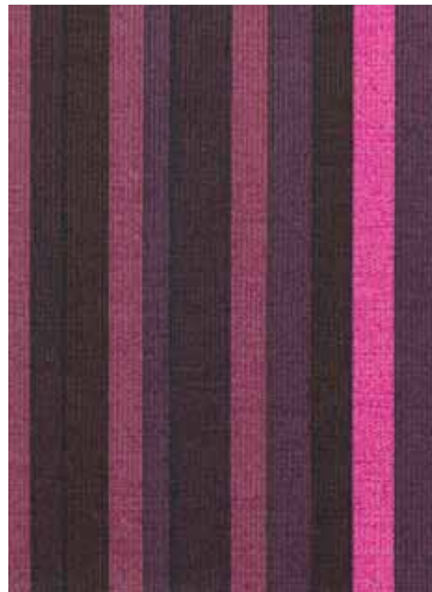
Toba Carrousel 8018