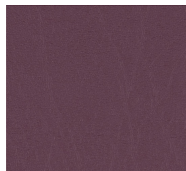
The 7 Collection Wine