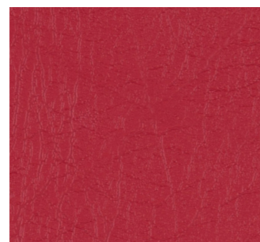
The 7 Collection Carmine