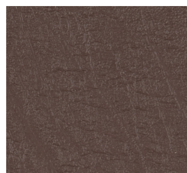
The 7 Collection Chocolate