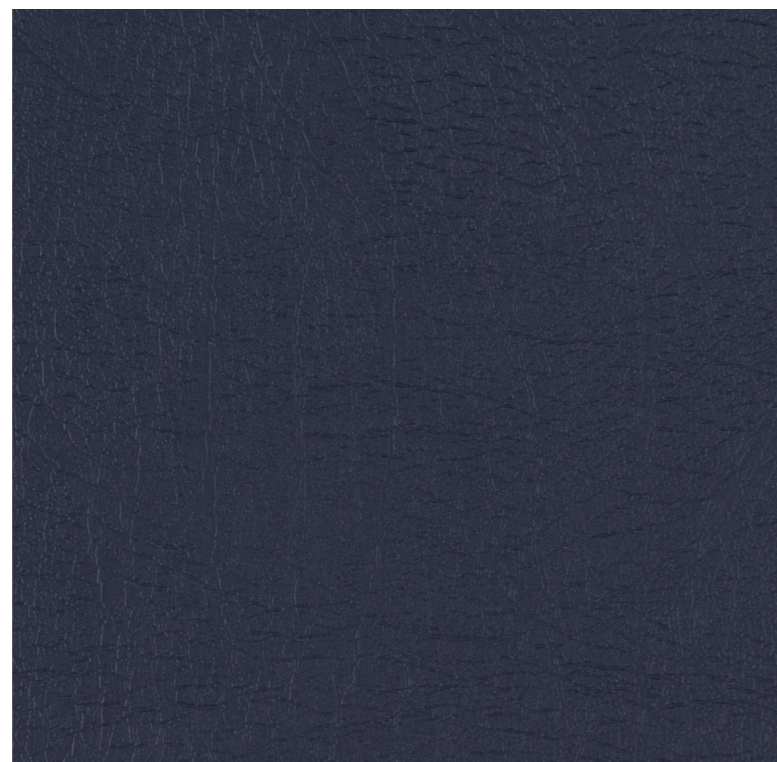
The 7 Collection Ensign