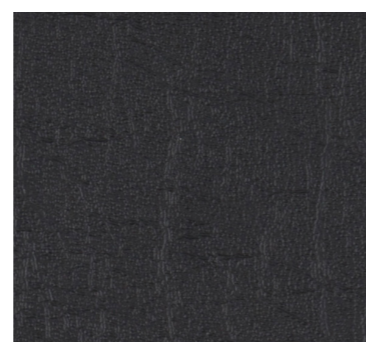
The 7 Collection Black