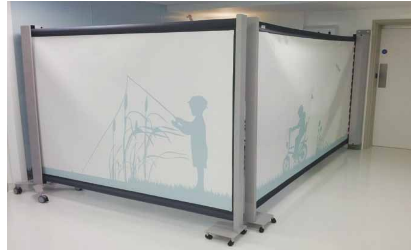
KwickScreen® provides privacy and dignity