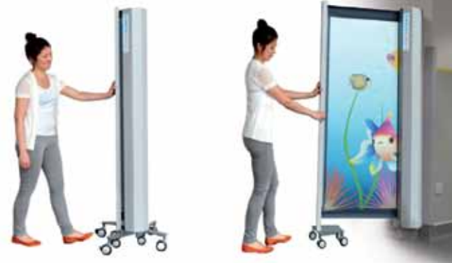
Portable or wall-mounted options available

“KwickScreens are really versatile and help us manage our space. They can be portable or fixed to the wall, they bend around corners and it’s easy to change the inner screens.”