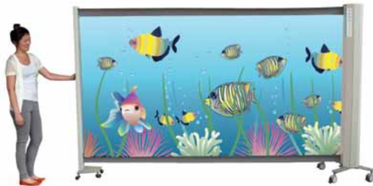
Retractable room-dividers with your choice of print

patients engaged in ward activity, while isolating non-airborne infections. KwickScreen® uses a patented high-tech rollable material technology that enables it to be incredibly retractable and portable. RolaTube™ is a new British technology used across many sectors including Nasa.