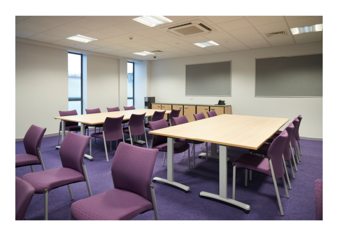
Admin Training room