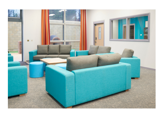
House unit lounge areas